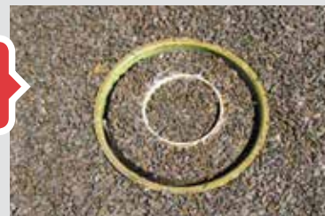
A double ring infiltrometer that is recognized by the EPA

Both methods will provide a good indication of the condition of the surfaces. In general, most new surfaces have an infiltration rate that exceeds the requirement for a one hundred year storm. Therefore, absolute accuracy may be more than is needed to establish the need to restore a surface.